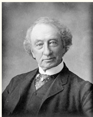
Figure 5: John Macdonald, first Prime Minister of Canada. 80

struggle between the Métis and Anglo-Canadians. Macdonald's inability, or worse unwillingness, to secure amnesty for Riel or to ensure that Wolseley and his men acted with restraint, does serious damage to his diplomatic legacy.