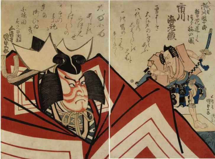
Kunisada Utagawa (1832): Ichikawa Danjūrō VIII, Shibaraku

ment of his name as well. 43 Aragoto plays showed the defeat of powerful oppressors and the deliverance of the helpless, not by samurai , but by heroes who stood up for the people. 44 In another famous aragoto play, Sukeroku 助六, the main character delivers an entrance soliloquy declaring himself to be “the savior of the Edo townsmen – who lived beneath the swords of 500,000 samurai .” 45