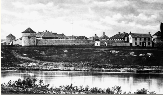
Figure 3: Old Fort Garry . 16

into and out of the Canadian Northwest. The original Hudson's Bay routes entailed ships sailing into Hudson Bay, which is frozen over nearly half the year, and unloading cargo into numerous canoes and York boats at York Factory. This cargo was then sailed or rowed up the Nelson River to Lake Winnipeg, south across the lake, into the Red River, and unloaded at Fort Garry (present day Winnipeg, Manitoba). 15