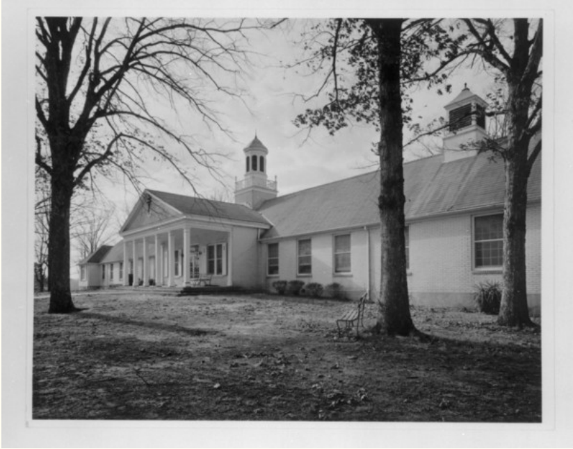
Figure 3: The A. C. Shipp Building of Thomas McRae Memorial Sanatorium for Negroes. 47

only, defense against the ravages of tuberculosis. 46 Accordingly, before technologies like the pneumothorax treatment, x-rays, sulfonamides and chemotherapy, the cornerstone of sanatorium treatment was to provide an environment that allowed the patient's own body to prevail over the disease.