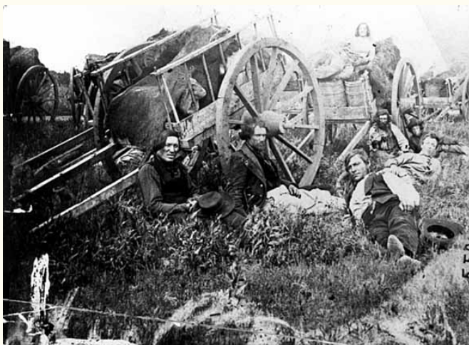
Figure 2: Red River carts and (Métis) drivers. 13

post to the large Métis settlement at St. Joseph (present day Walhalla, North Dakota). The Hudson's Bay Company eventually realized the extent of the American threat and acted to undercut their burgeoning competition. The Company could offer one product that the Americans legally could not, rum. By 1854, Kittson could no longer compete with the British rum suppliers and left the fur trade. However, Kittson had been able to crack the door open to Red River and established Americans as the preferred Métis trade partners.