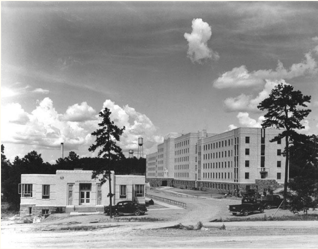
Figure 1: The Nyberg building and an office building of the Arkansas State Tuberculosis Sanatorium in Booneville which was segregated until 1967. 37

that source.” 36 The beneficent intent was directed towards whites, not blacks, and as a result the government resisted appropriations that supported what they saw as the superfluous treatment of blacks. This attitude is manifest in the appropriations made, the lack of effort put into education, the inattention to providing trained medical staff, the dearth of medical equipment and the disinterest in maintenance to the sanatorium. Moreover, state officials without McRae’s paternalism and anti-tuberculosis background had difficulty spending anything on black consumptives, reinforcing the Jim Crow system.